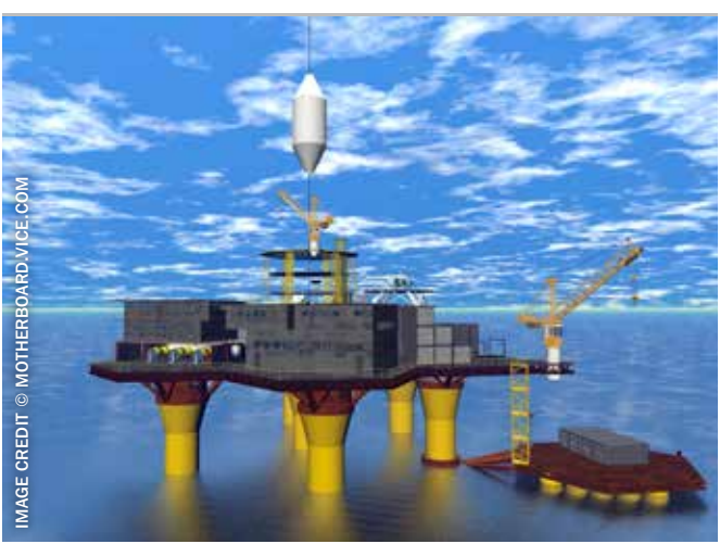
Dennis Tito after returning from space in 2001.

The research showed that material strength properties would be available in the laboratory between 2015 and 2016. The design of the macro-tether could be tested in the late 2020s. The major hurdle for a successful space